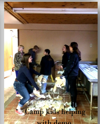
Camp kids helping with demo.