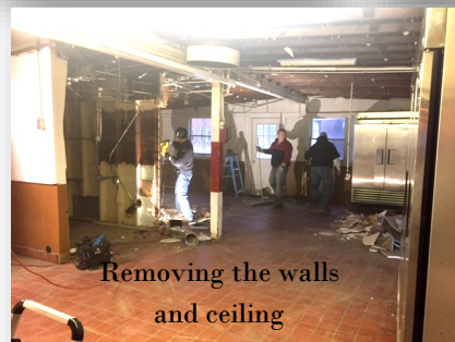
Removing the walls and ceiling