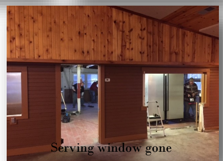
Serving window gone