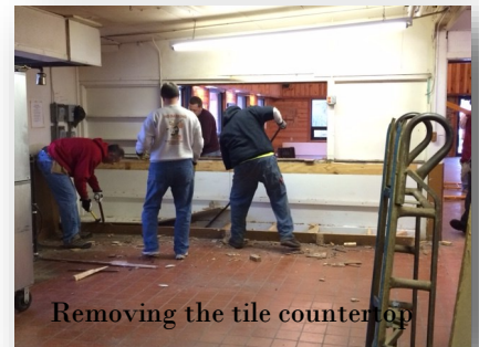
Removing the tile countertop