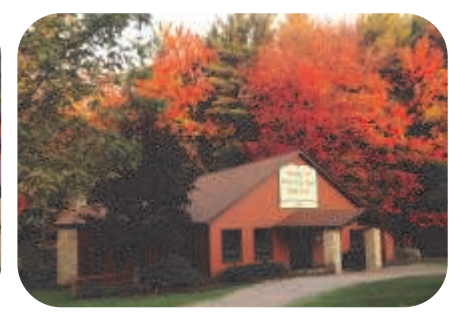
What a change! The chapel in 2003, then in 2009, and now in 2013