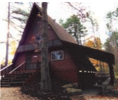
Some newly finished A-frame renovations: outdoor painting, the main sleeping area, and the entryway bench