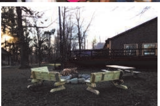
The new fire ring outside the Dining Hall