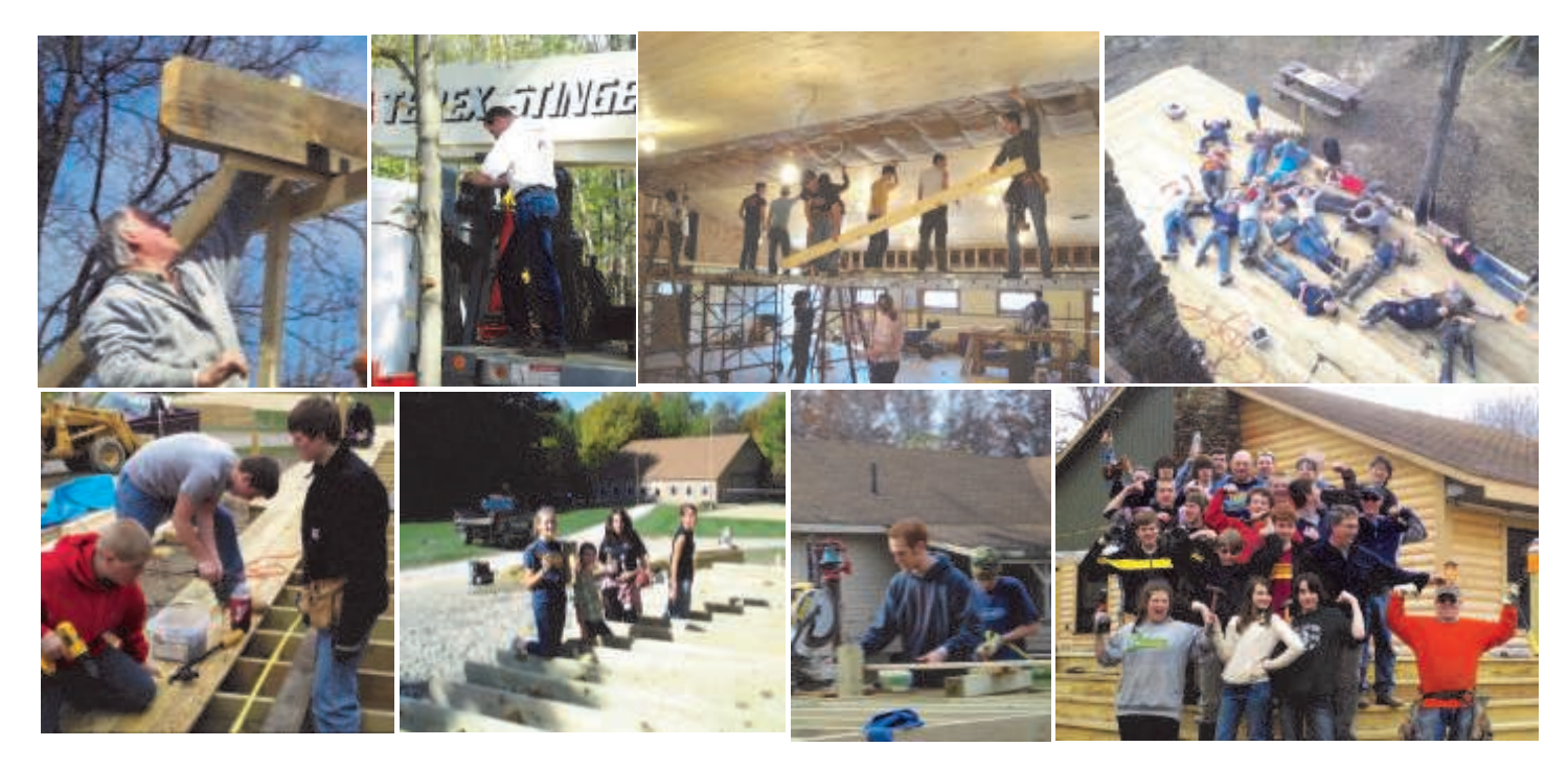
Some of our many faithful volunteers