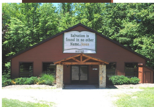
Carl Smith Chapel

As Stony Glen Camp grew from tent sites to multiple cabins, Dining Hall, Rec Hall and more in its first 20 years, Stony Glen's Trustees "were increasingly burdened about the need for full time staff at camp," according to the Whence and Whither camp history.