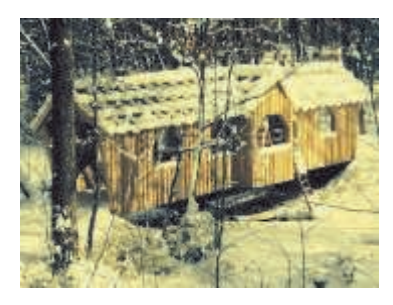
Wow! Would you look at that! This is the recently refurbished bridge over the creek leading to Milner Lake

Check out some of the new additions to the Camp! We hope you can make it out to enjoy them soon!