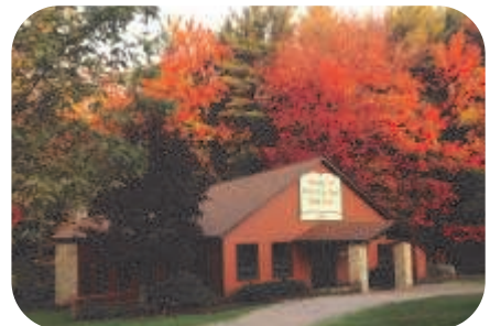
What a change! The chapel in 2003, then in 2009, and now in 2013