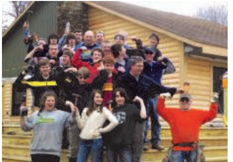
Some of our many faithful volunteers