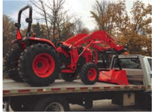
Our new Kubota tractor