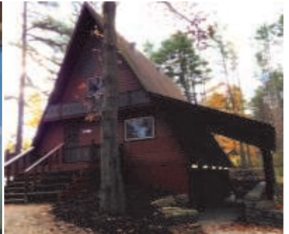
Some newly finished A-frame renovations: outdoor painting, the main sleeping area, and the entryway bench