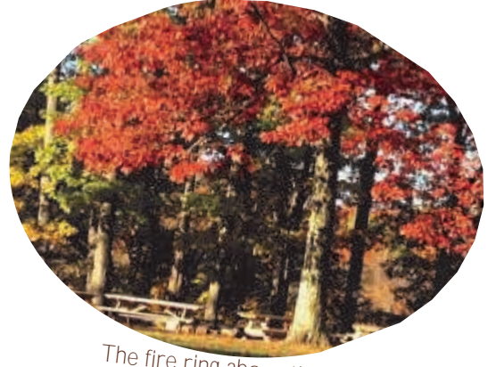
The fire ring above the Glen