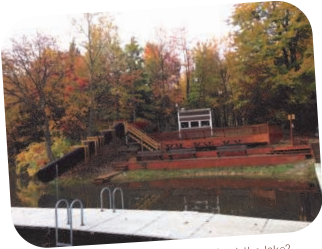
Can you spot the new waterslide at the lake?