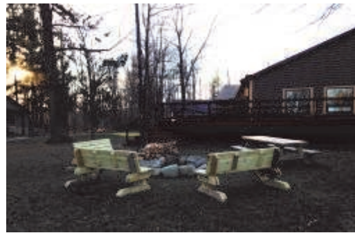
The new fire ring outside the Dining Hall