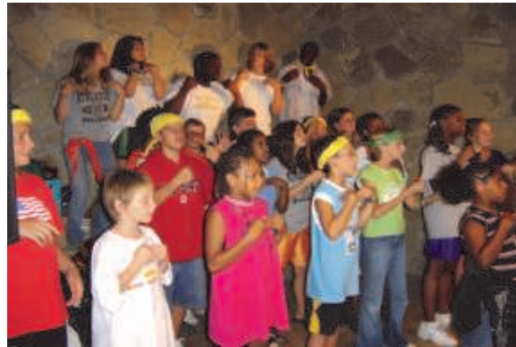
Campers making a joyful noise in the chapel